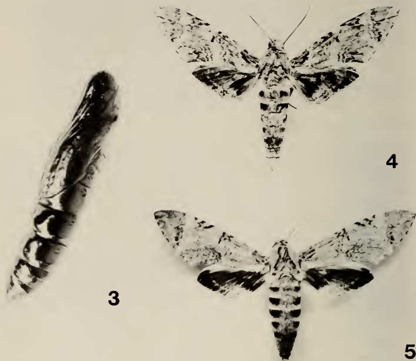
FIGS. 3-5. P. tetrio stages: 3, pupa; 4, male; 5, female.